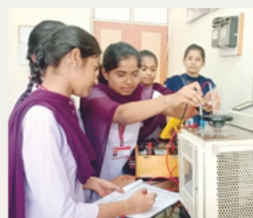
Electrical Circuit Lab