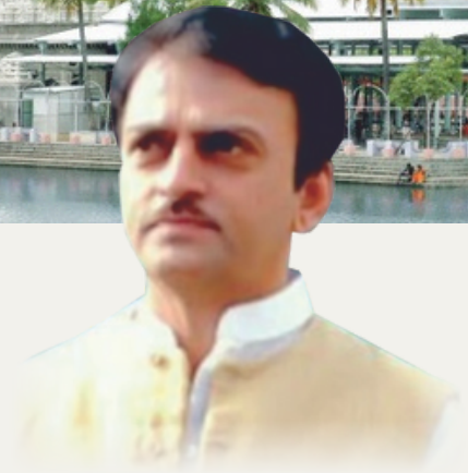
Hon'ble Shri. Dharmraj Kadadi

Shri Siddheshwar Devasthan Trust founded Shri Siddheshwar Women's Polytechnic with the "Vision" Social Transformation through dynamic education and women empowerment through technical education.